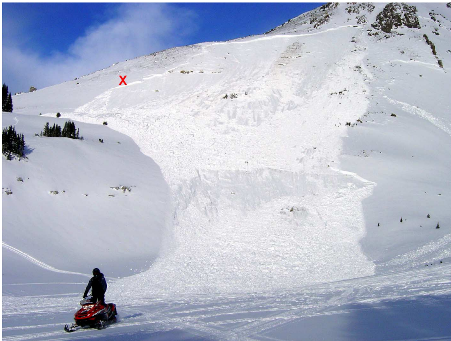
Figure 2: This avalanche, located on Crown Butte near Cooke City, Montana, was triggered by a snowmobiler. A subsequent snowpit (at the "X") demonstrated false-stable stability test results (SB50 Q2).