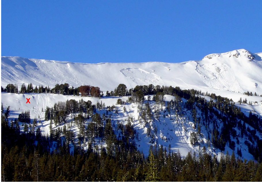
Figure 1: This picture shows an overview of the Henderson Bench area near Cooke City, Montana. The "X" indicates a snowpit location that gave false-stable results (SB40 Q1).